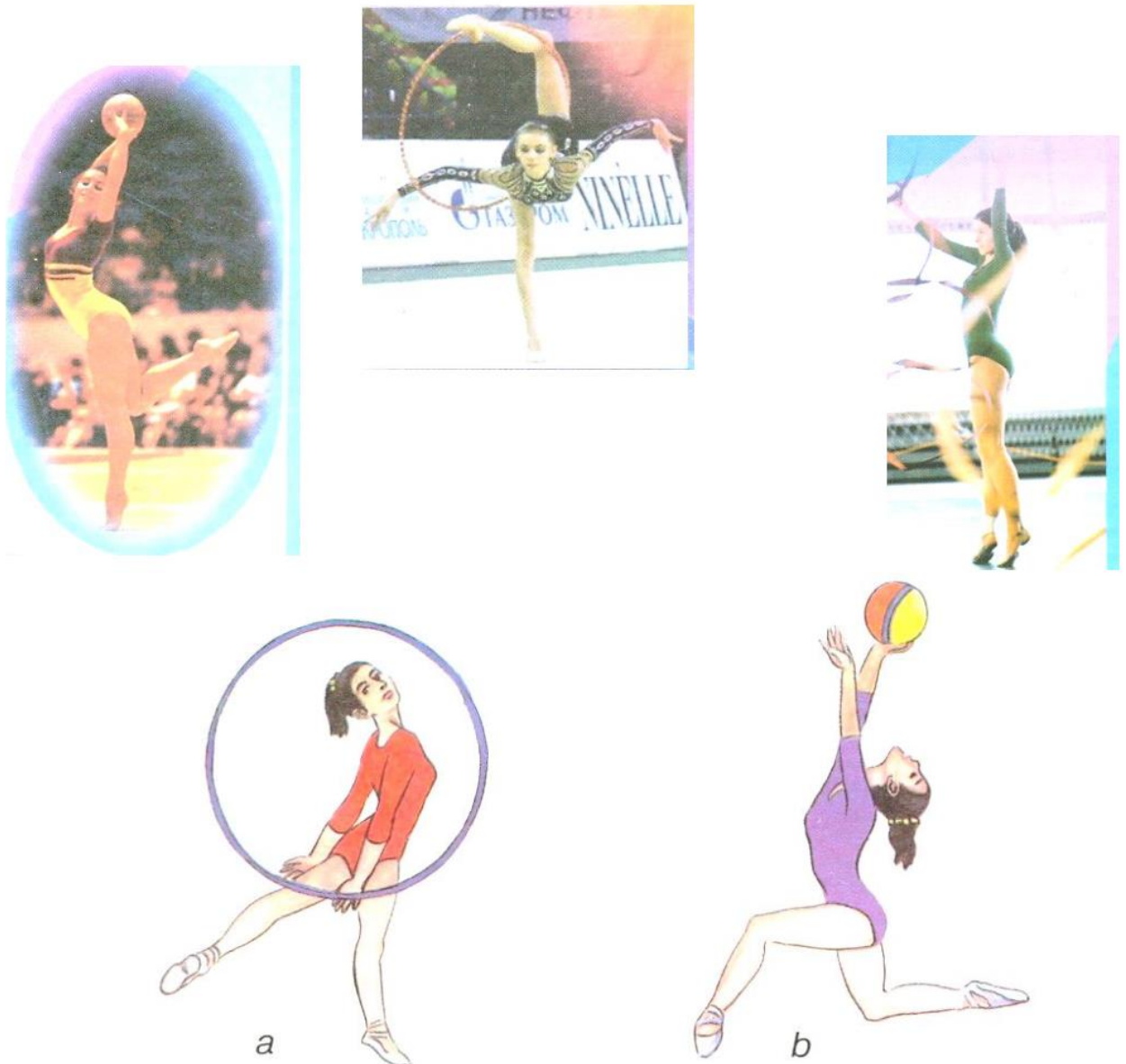
Rhythmic gymnastics movements

ribbons, etc.). In addition, this type of movement can be performed indoors and outdoors, on the ground and on ice. Whatever action is taken, it is in the nature of an artistic action. In this type of movement, a person's ability to control his body is fully demonstrated.